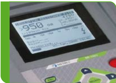
Real time resistance against time graph plotting facility