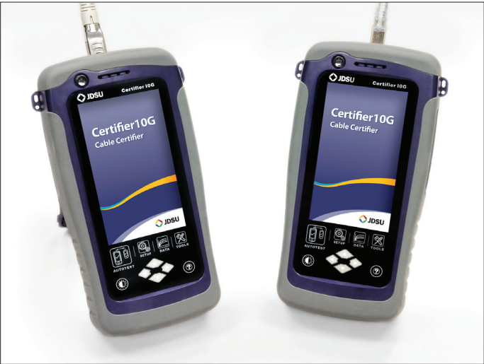
Two complete units minimize time initiating, naming, and saving results