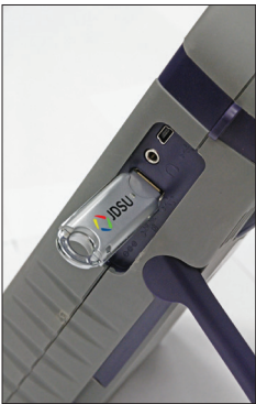
USB flash drive supports transferring test results