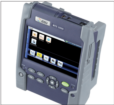
For fiber testing and certification capabilities, combine the Certifier10G with one of the market-leading JDSU fiber testers, such as the T-BERD/MTS-2000

The Certifier40G performs complete copper, fiber, MPO, and fiber end-face certification to the latest enterprise connectivity industry standards and requirements with one tester. Visit www.jdsu.com/go/Certifier40G or contact JDSU for more information.